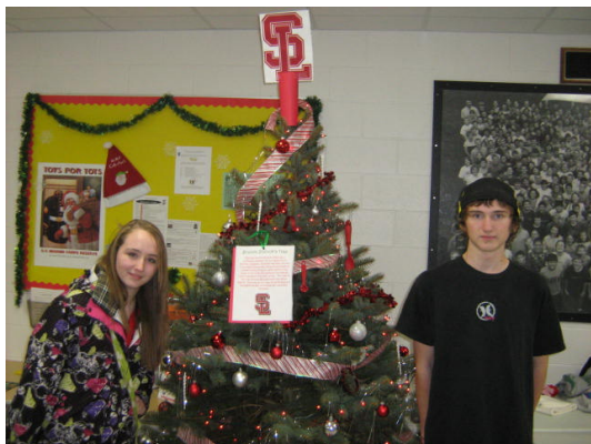
The Blahnik Family Tree

Our 12 Trees of Giving fundraiser was very successful! The students and staff help raised almost $1900 for local charities! Thanks to all of you for supporting this event!